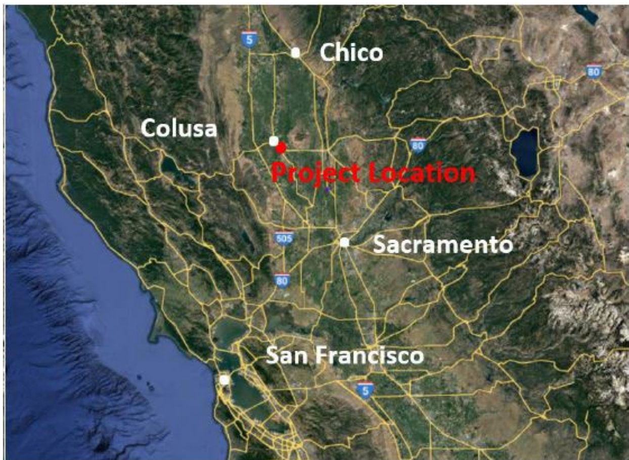
1) General vicinity map