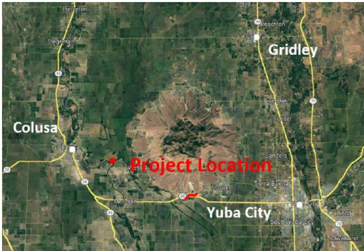
2) Proposed project location map